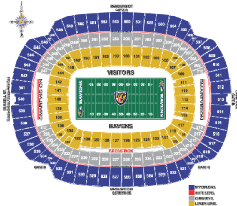
M&T Bank Stadium (Baltimore Ravens)

A seating layout of the M&T Stadium is shown below for the Baltimore Ravens games [6].